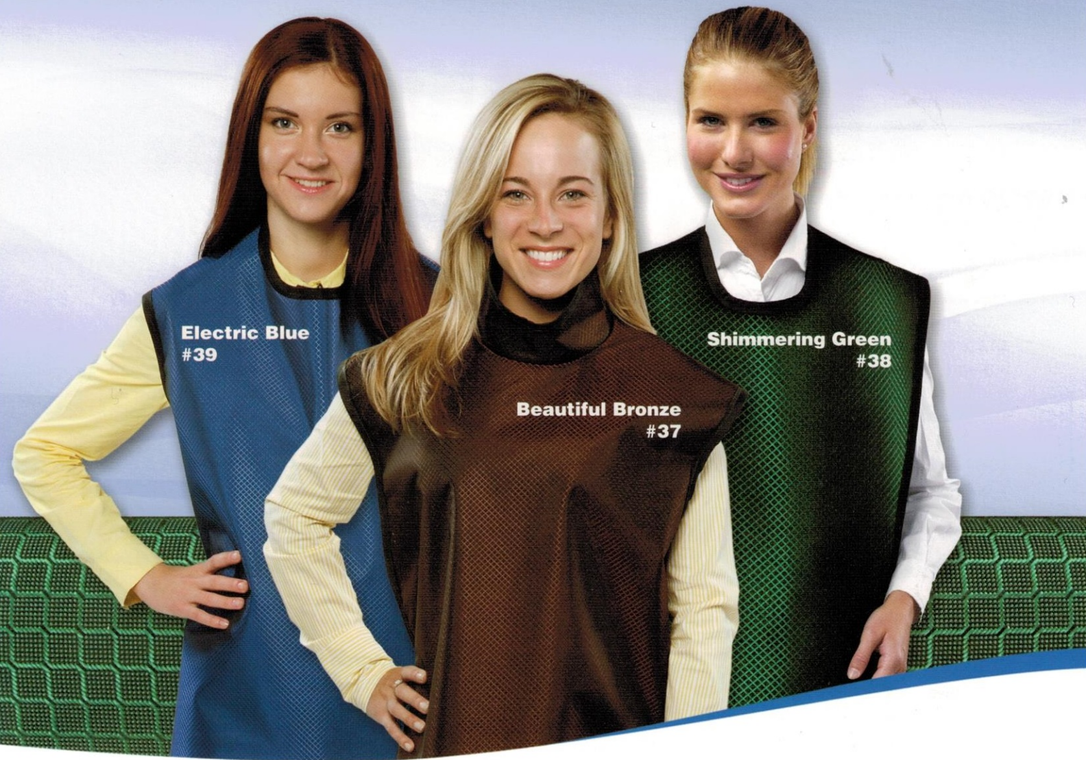
Electric Blue #39