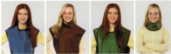
Bib Apron Bib with Collar Panoramic Thyroid Collar

For maximum coverage, order your apron with a sewn-on thyroid collar. Separate thyroid collars are available as well. Flow also carries the Uni-Hanger, which allows you to hang your apron on a hook or in a closet to prevent folds that can damage the lead lining.